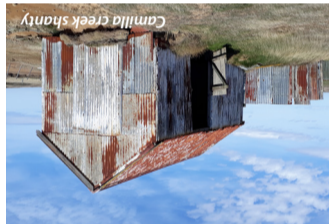
Camilla creek shanty

The shanty is the turn-around point. With the building behind, bear left to a very clear vehicle track which runs alongside a fence, heading in a southerly direction. The communication mast for Darwin & Goose Green can be seen in the distance,